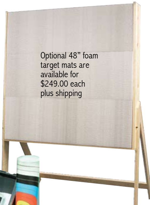
Optional 48" foam target mats are available for $249.00 each plus shipping

If you are already a certified archery instructor, you can visit www.goarchery.com and take the online training course prior to ordering materials.