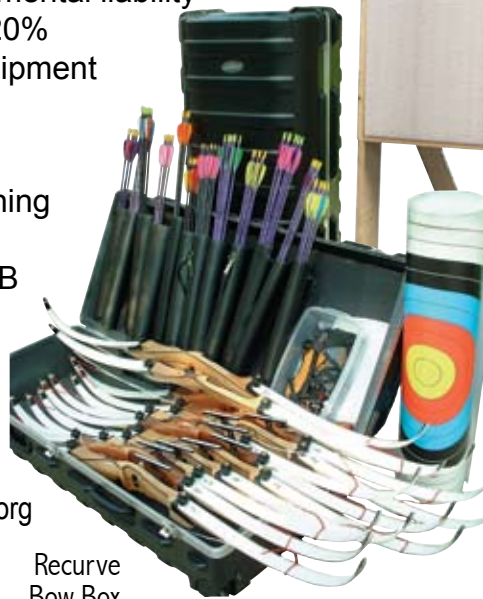
Recurve Bow Box

NADA Bow box contains everything you see here, including an SKB container that converts to a floor rack when open.